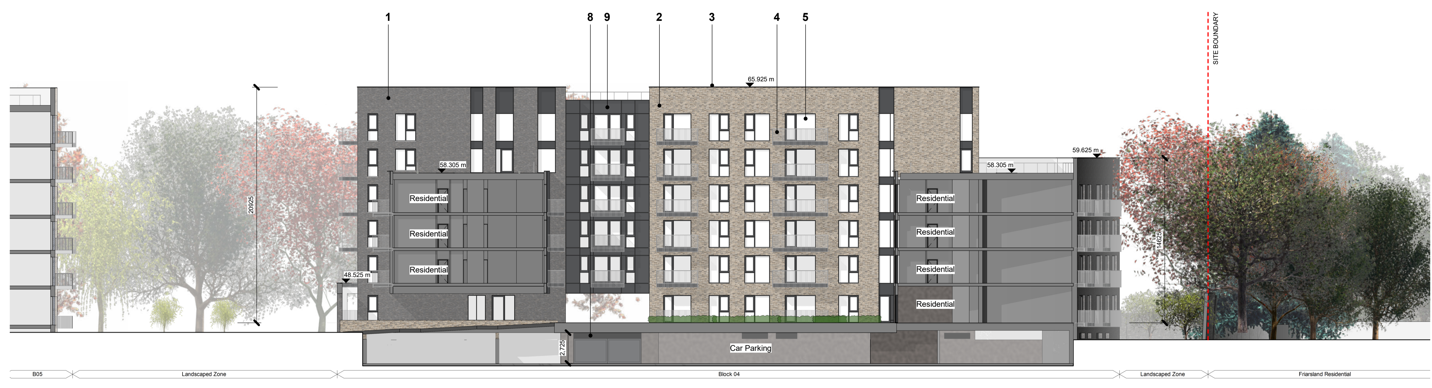
Block 04, South Courtyard Elevation 1 : 200