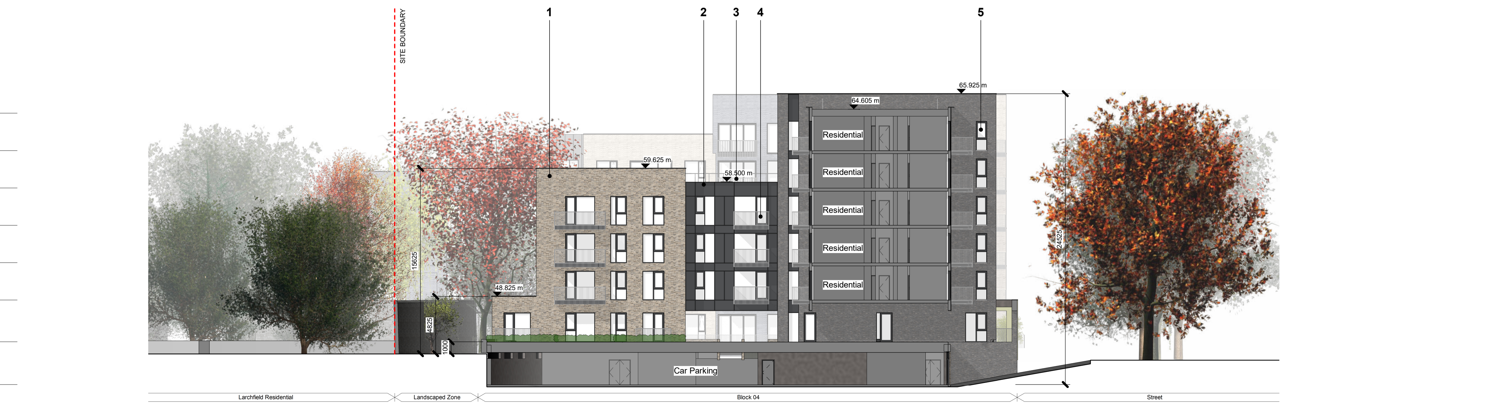
Block 04, East Courtyard Elevation 1 : 200